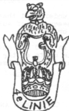
4 e de LIGNE