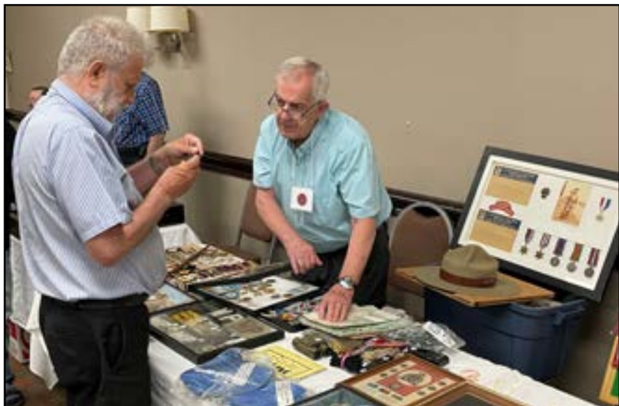
Getting ready to make an offer.