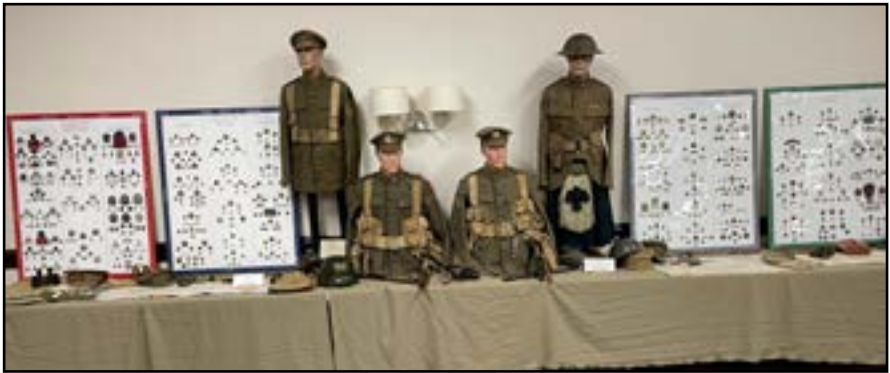
The 1st Place display receiving the gold medal for the fabulous display on the First World War Canadian Corps featuring badges and insignia for each of the Four Divisions.