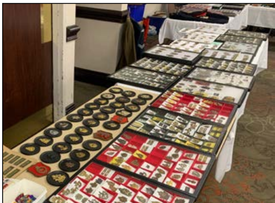
The tables were loaded with great material.