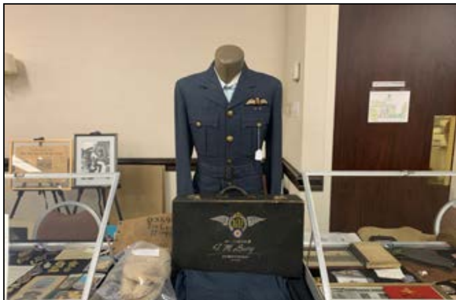
Uniforms, photographs and military literature.