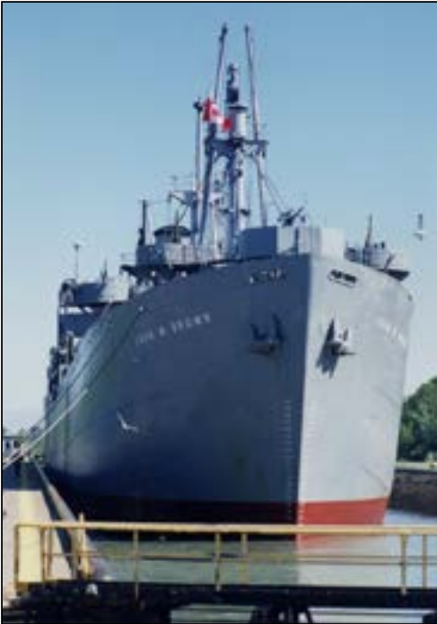
Bow view of the Brown as the gates of Lock One prepare to open on the Welland Canal.