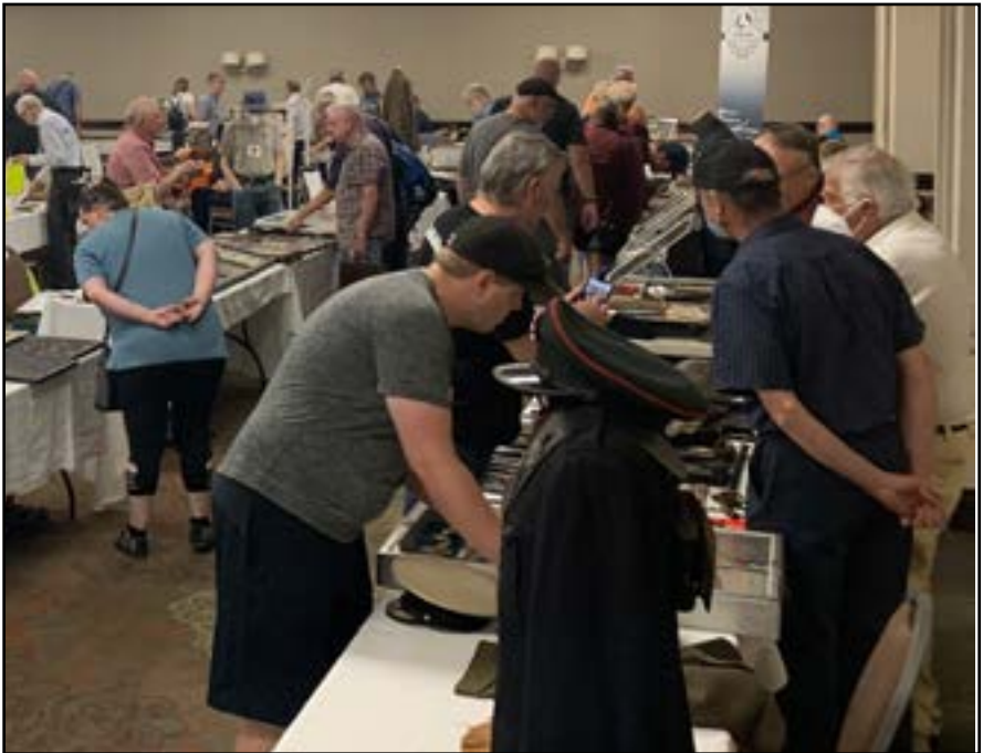
Overview of the show floor.