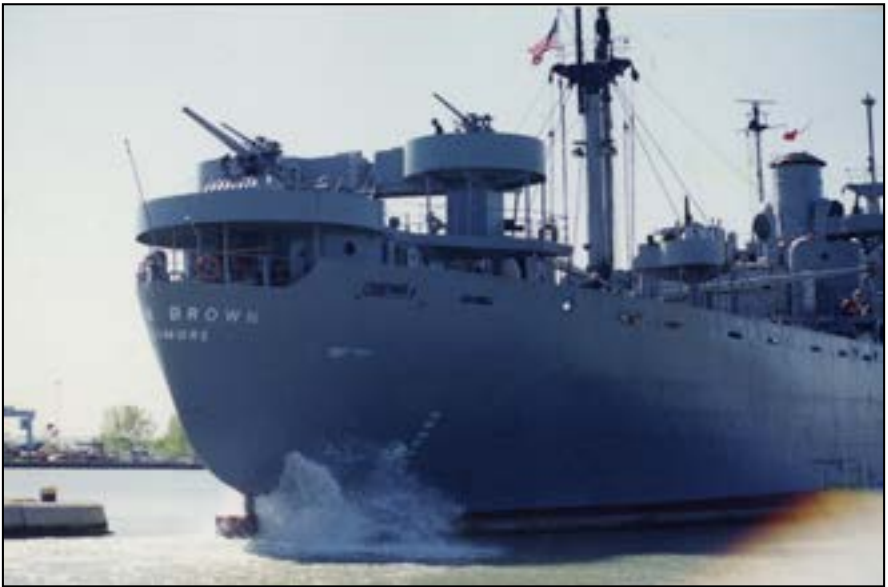
The Brown transits the Welland Canal - stern guns in their platforms.