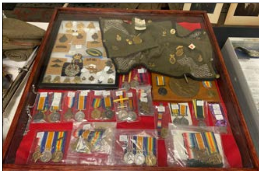
A wide selection of medals were available.