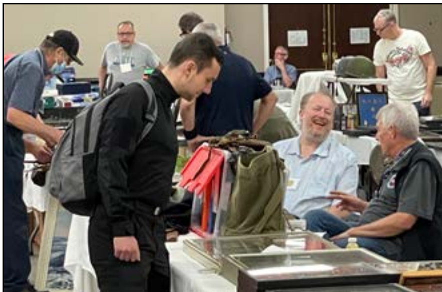
Looking for that specific item.