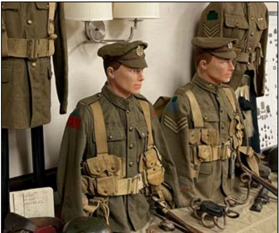
Detail of the gold medal display of the CEF Canadian Corps including kit and materials from the period.