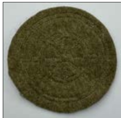
left: obverse view right: reverse view