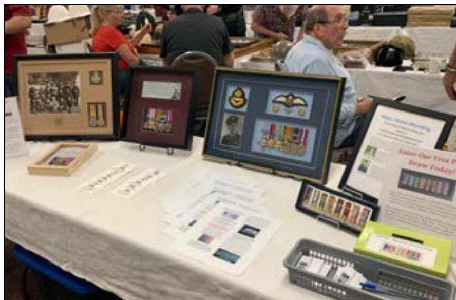
Mounting & framing services were available to create that unique presentation.