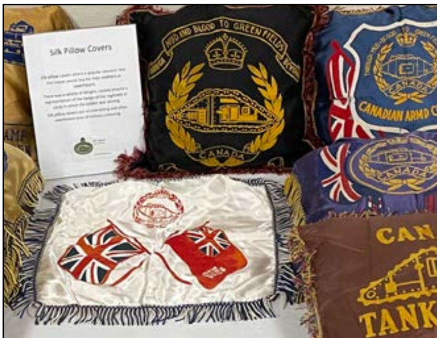
John Nayduk's souvenir silk pillow collection featuring regimental insignia earned a bronze medal.